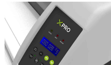
Simple and intuitive control panel