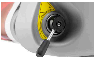
Pneumatic lifting and lowering of the roller with lever