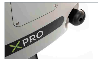
Adjustable lamination pressure