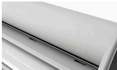
Antisticking silicon roller