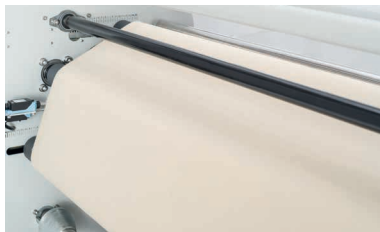
High quality felt belt