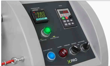
Easy to use temperature and speed control panel