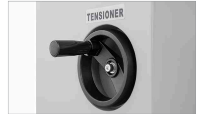
Felt tensioning adjustment