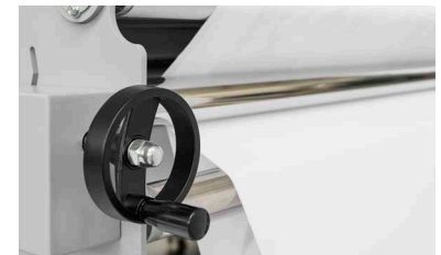
Fabric tensioning adjustment