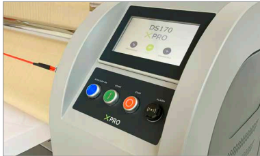
Easy to use touch screen display