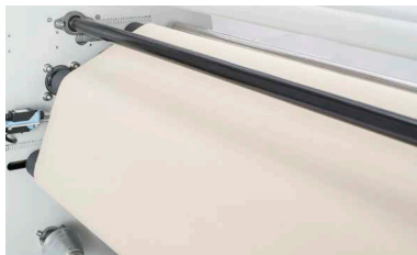
High quality felt belt