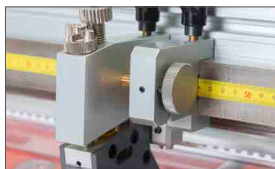
Fine positioning of the cutting blades (standard)