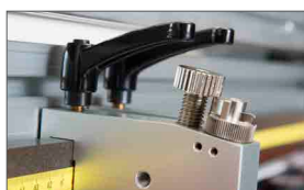
Fine pressure adjustment (according to the types of material)