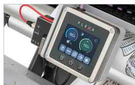
Automatic vertical alignment control panel