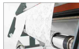
Front rewinding system: it rewinds the cut media up to three smaller rolls (optional)