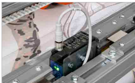
Advanced cutting mark reader