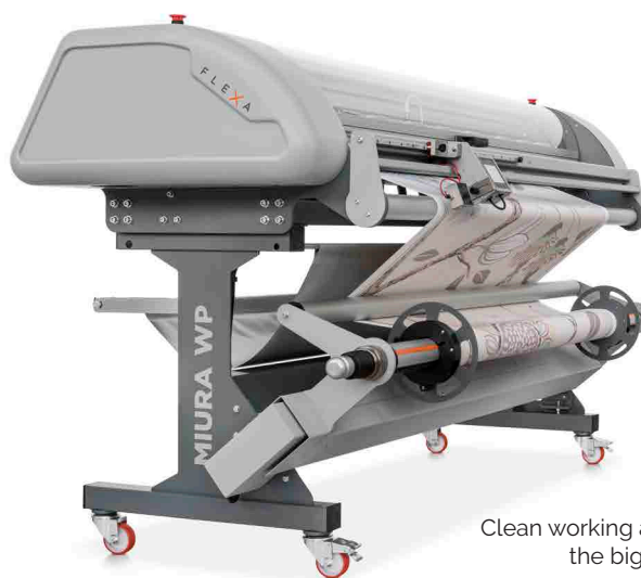
Clean working area thanks to the big waste basket