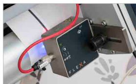
Optical sensor for vertical alignment