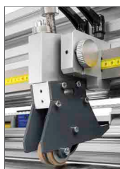
Single lengthwise rotary crush cutter (twin cutters optional)