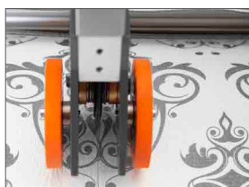
Slimline lengthwise rotary crush cutter, single or twin, (optional)