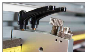
Fine pressure adjustment (according to the types of material)