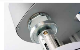
Ease of loading heavy rolls thanks to the air expansion shaft