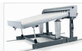
Can be fitted with: (optional): 1. Motorized Stacker in line with the cutter: height and inclination electronically adjustable; extensible length up to 3,2 meters 2. Folding collecting table 3. NEW Tilttable collecting table with wheels