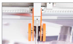
Single lengthwise rotary crush cutter (twin cutters optional)