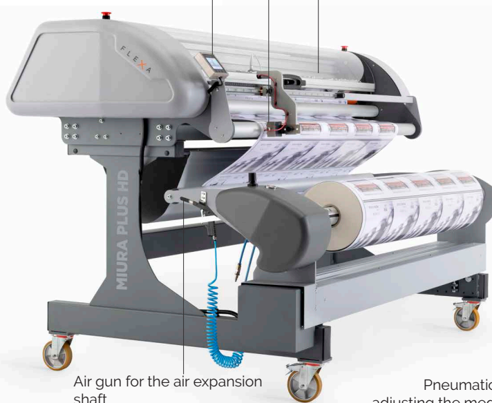
Air gun for the air expansion shaft