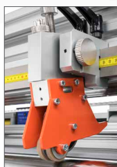
Slimline lengthwise rotary crush cutter, single or twin, (optional)