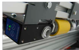
Advanced cross cut mark reader