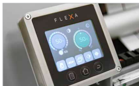
Automatic vertical alignment control panel