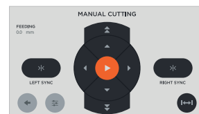
User-friendly software design