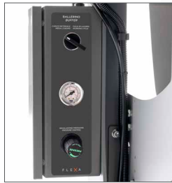
Control board for media tensioning