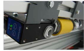
Advanced cross cut mark reader