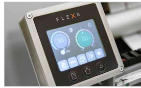
Automatic vertical alignment control panel