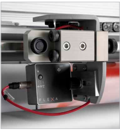
Optical sensor for vertical alignment