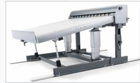
Media from the printing machine