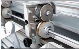
Lengthwise shear cutters (twin cutters optional)