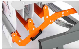
Integrated pneumatic counterbalanced buffering system: it keeps the media always tensioned avoiding tears