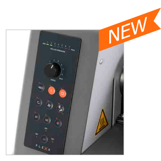
New roller pressure display to avoid "overpressure"